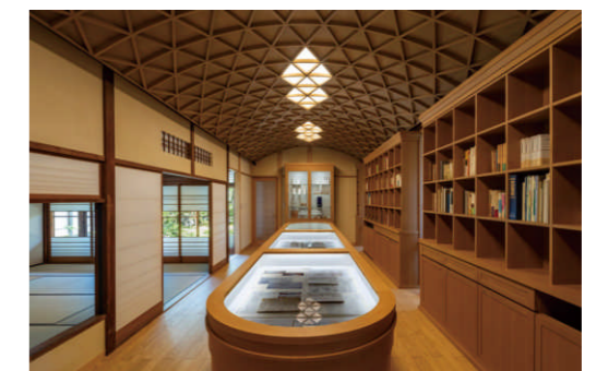
The lounge