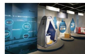
Special exhibition: Condominium Disaster Prevention Exhibition