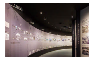
"History of condominiums" zone: A presentation on the transition of condominiums in Japan and the rest of the world

Group companies for training purposes, resulting in a total of 4,157 visitors in fiscal 2023 and a cumulative total of 19,674 visitors.