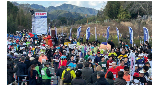
Asuka Half Marathon 2024

In fiscal 2023, the taxes we donated were allocated to finance five projects related to the project for inscription on the World Heritage List on which Asuka Village has been working, namely (1) Asuka Half Marathon project, (2) low-season tourist attraction campaign project, (3) wild animal control measure project, (4) safety measures project.