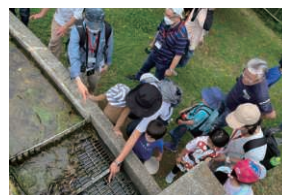
Observing living creatures

paths they usually walk casually, and that it was very interesting to learn more about the plants they are familiar with.