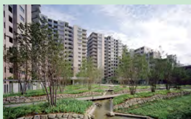
2004 Fukasawa House ● The first introduction of disaster prevention sets