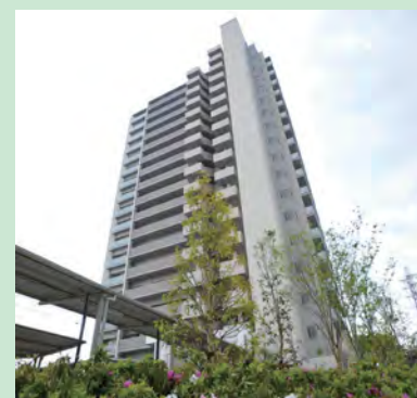
2011 BRANCHERA Urawa ● Long-life, high-quality housing

~2005 ~2006 ~2007 ~2008 ~2009 ~2010 ~2011 ~2012 ~2013 ~2014 ~2015 ~2016 ~2017 ~2018 June 2019