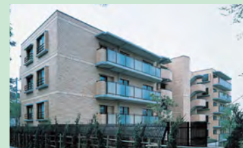
1984 Palais Royal Ashiya-Midorigaoka