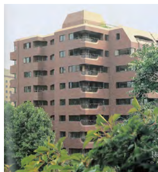
1977 Palais Royal Nagatacho

Completed construction of "Shiba Head Office Building" in Shiba, Minato-ku, Tokyo and transferred headquarters there