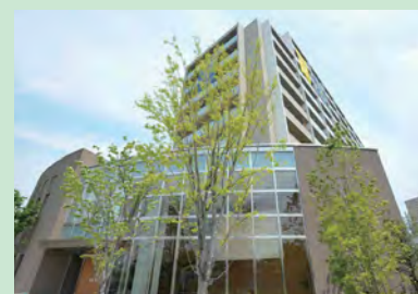
2011 BRANCHERA Suitakatayamakoen ● Long-life, high-quality housing