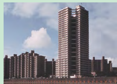
1992 Acrocity Towers

● The first ultra-skyscraper condominium