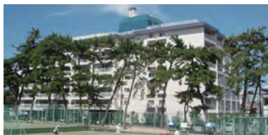
1969 Ashiya Matsuhama Heights

Established Hasegawa Komuten in Amagasaki-shi, Hyogo