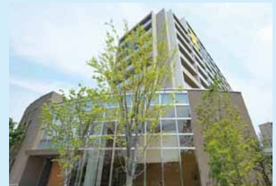
2011 BRANCHERA Suitakatayamakoen ● Long-life, high-quality housing

Joint Corporation changed its name to Haseko Real Estate Development, Inc.