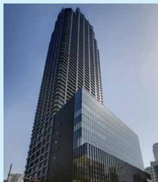
2009 The Kitahama ● 54-story ultra-skyscraper condominium

Sohgoh Real Estate Co., Ltd. became a subsidiary by share acquisition (the present consolidated subsidiary), Main businesses are for-sale real estate business, real estate solutions and condominium management businesses