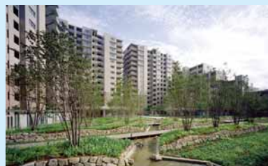
2004 Fukasawa House ● The first introduction of disaster prevention sets