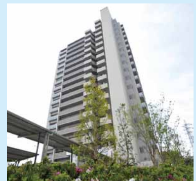
2011 BRANCHERA Urawa ● Long-life, high-quality housing