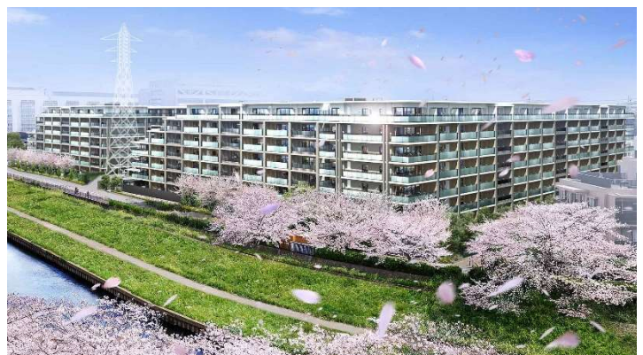
Conceptual image of exterior of Renai Yokohama Totsuka