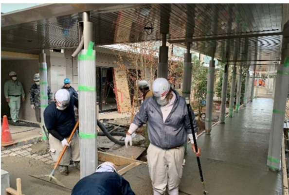
Corridor of a courtyard that used H-BA concrete